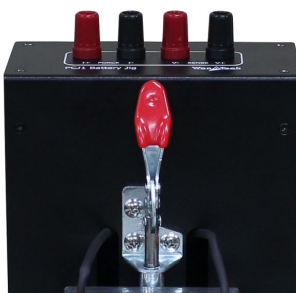
banana socket panel & clamp lever