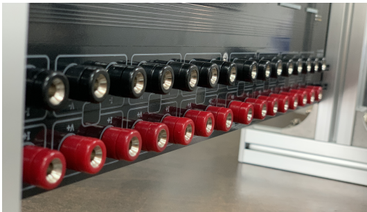
Optional banana socket panel