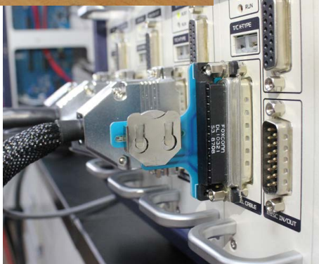
CCH3 with ZIVE MP2