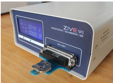
CCH3 with ZIVE SP1