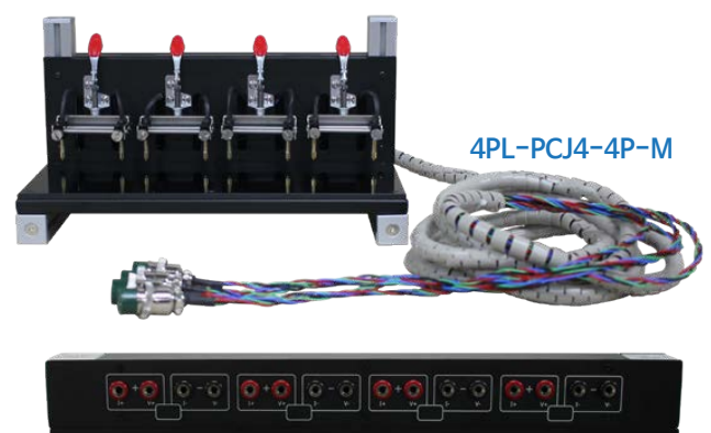
Optional 4ch banana socket panel