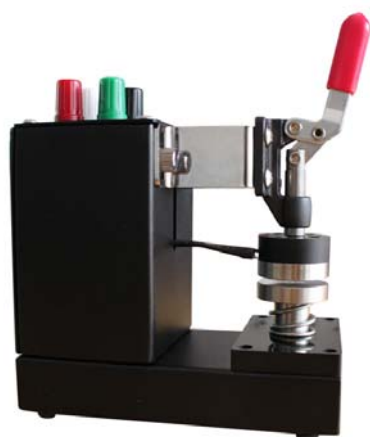
MCJ (Through-Plane Conductivity Test Jig)

Normally, a number of galvanostatic alternating current(AC) electrochemical impedance spectroscopic (EIS) techniques or DC techniques are used to estimate the membrane conductivity. User can set up a perfect system with one of ZIVE series Electrochemical Workstation with MCJ conductivity test jig for through-plane conductivity measurements.