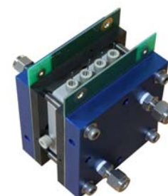
MCC with fuel cell hardware fixture